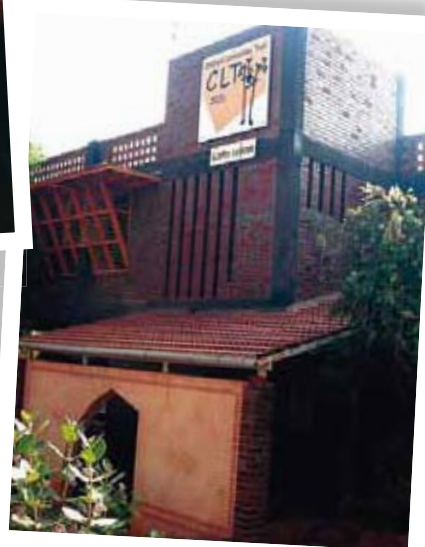
CLT - Children Lovecastles Trust